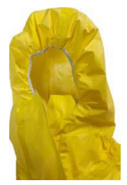
Chin Protection which fit for the mask and resperitor better