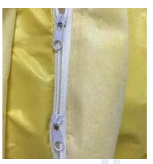
Double way heavy duty zipper