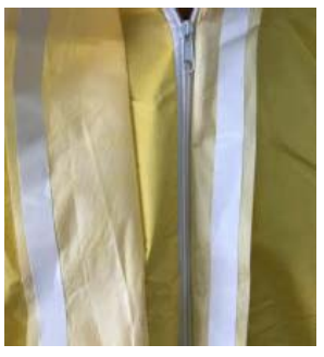
Double storm flap resealable with adhesive tape