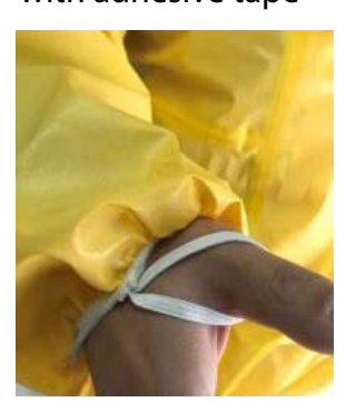
Elastic band thumb loop