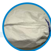
Serged seams inside