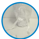
Fixation ties in the middle