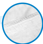
Serged seam finish