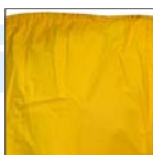
Elastic waist for the pant