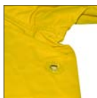
Ventilated cape back & underarms