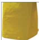
Plastic snap button on sleeve & leg opening