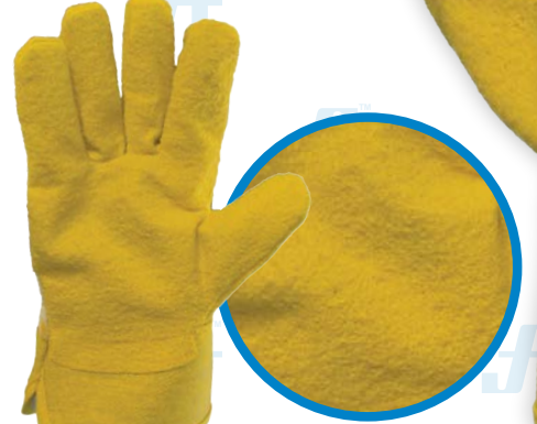
Synthetic PVC leather (Rough textured)