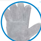
Full leather front