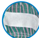
Leather strip on knuckles