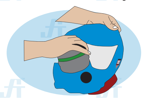
2. Prepare the hood for putting it on