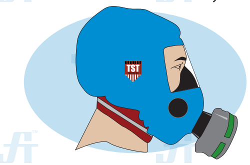
4. The hood is in place