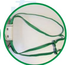
Welded elastic adjustable band

Accommodates a wide range of safety equipment, including eye, ear, & face protection.