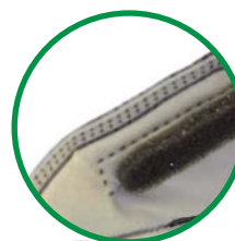
Soft foam face seal