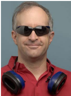
Smart foldout storage position