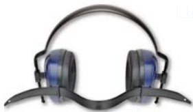
AV-SS25 Support Strap (Optional)