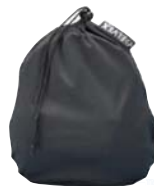
AV-SGB30 Fits all earmuffs (Optional)