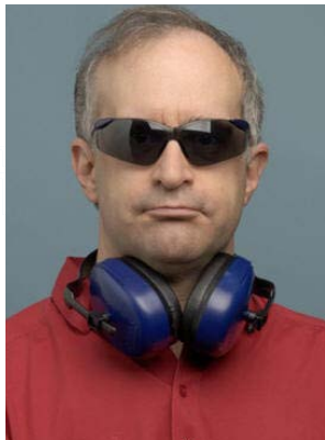
Normal muff storage position