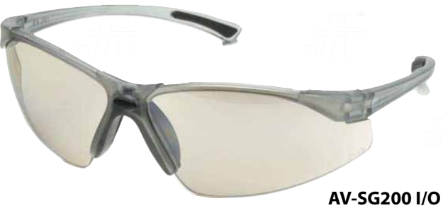
Indoor/Outdoor HC/PC Lens