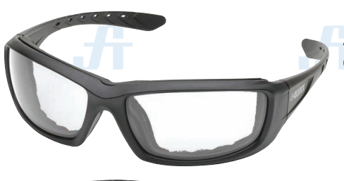
AV-GG55 C Clear/Clear AF Hard coated