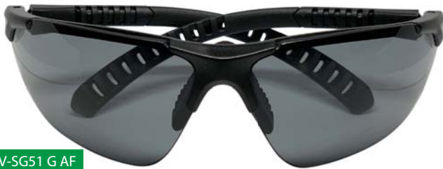
AV-SG51 G AF

1pc/polybag, 12pcs/inner box, 144pcs/carton