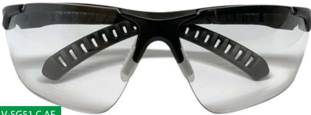
AV-SG51 C AF