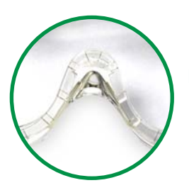
Soft nose bridge