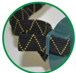
Adjustable elastic strap