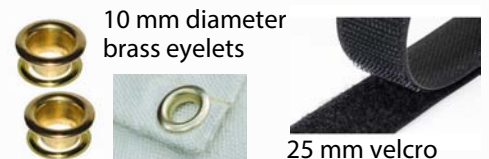
10 mm diameter brass eyelets