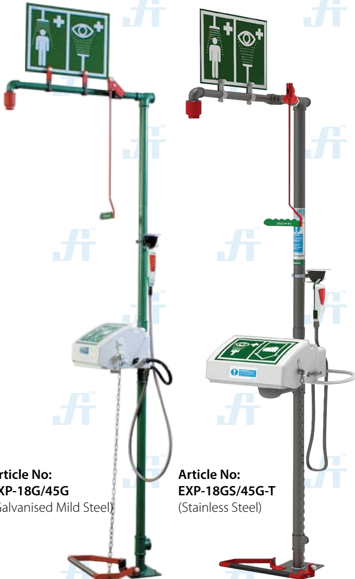
Article No: EXP-18G/45G (Galvanised Mild Steel)